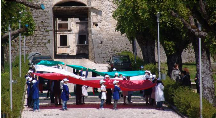
The children of the local primary school made the Italian flag in three parts