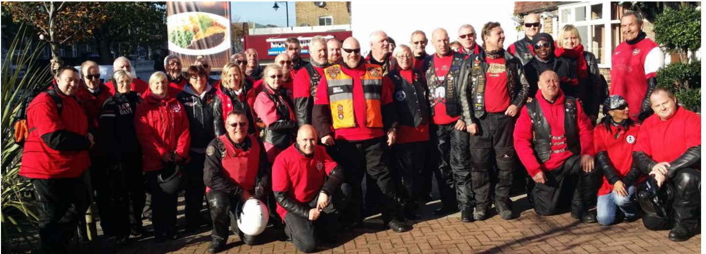
MEMBERS OF THE MERIDIAN CHAPTER