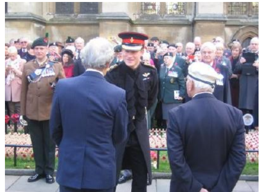
HRH PRINCE HARRY STOPS FOR A WORD WITH JOHN