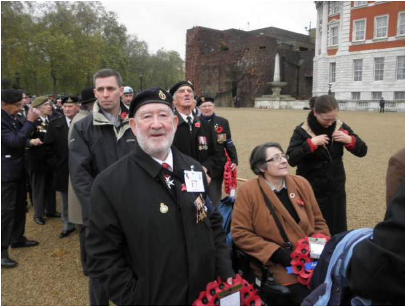
On Horseguards Parade waiting for the columns to line up