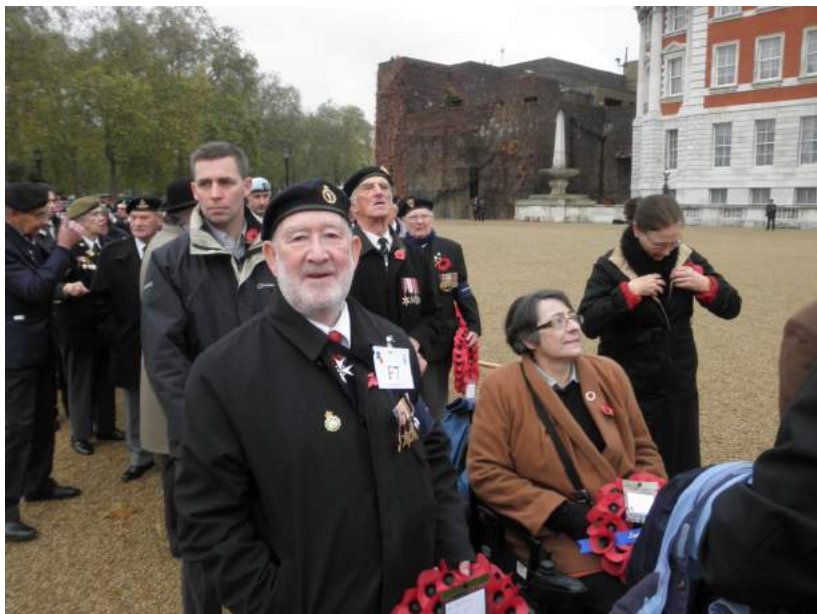
On Horseguards Parade waiting for the columns to line up