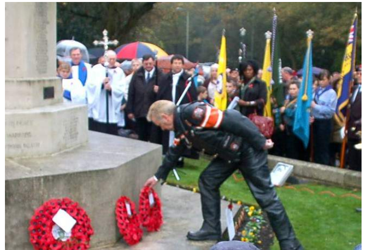
Remembrance Sunday Parade 2010 Chislehurst, Kent